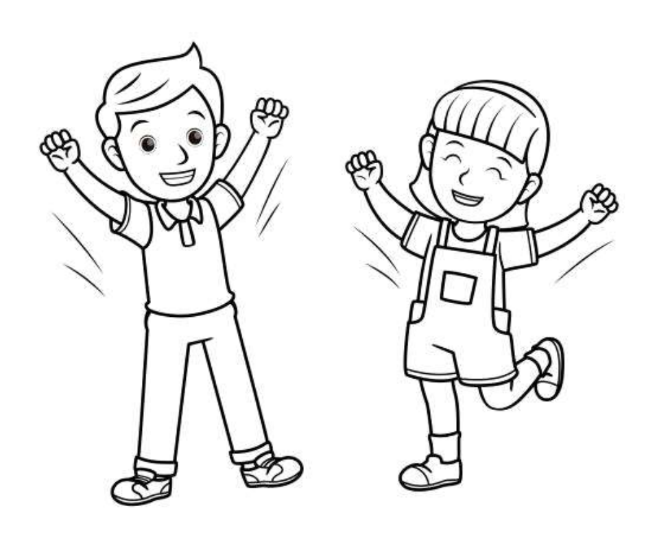
"No one whose hope is in You will ever be put to shame." (Psalm 25:3)